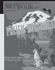
Spinone National Park Poster Image